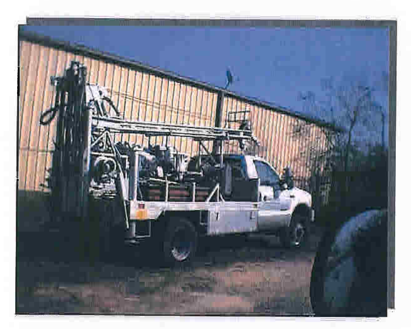
Typical Drilling Rig