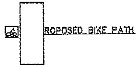
EXHIBIT SEE 8 12-b-11 cw PENSAD 800-631-6999