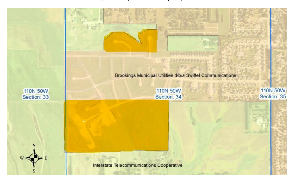
Map 1 – Changes made in Docket TC21-041

Therefore, Staff has reopened docket TC13-026 for the Commission to complete its biennial certification of the South Dakota SABs for 2023. Staff is aware of three boundary changes that have occurred since the Commission's previous Order Certifying Study Area Boundary Changes on February 22, 2021. Those changes resulted from amended certificates of authority issued in dockets TC21-041, TC22-057, and TC22-069. The boundary changes are depicted in the maps below. The highlighted portion of the maps were added to respective boundaries of Brookings Municipal Utilities dba Swiftel Communications and Beresford Municipal Telephone Company.