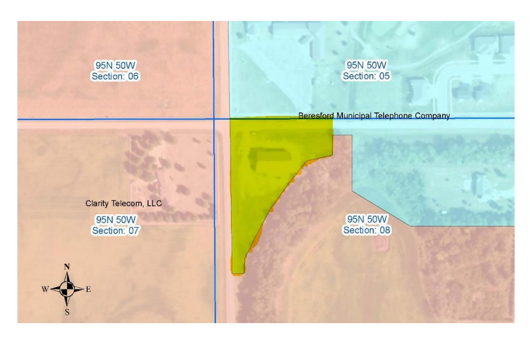
Map 2 – Change made in Docket TC22-057