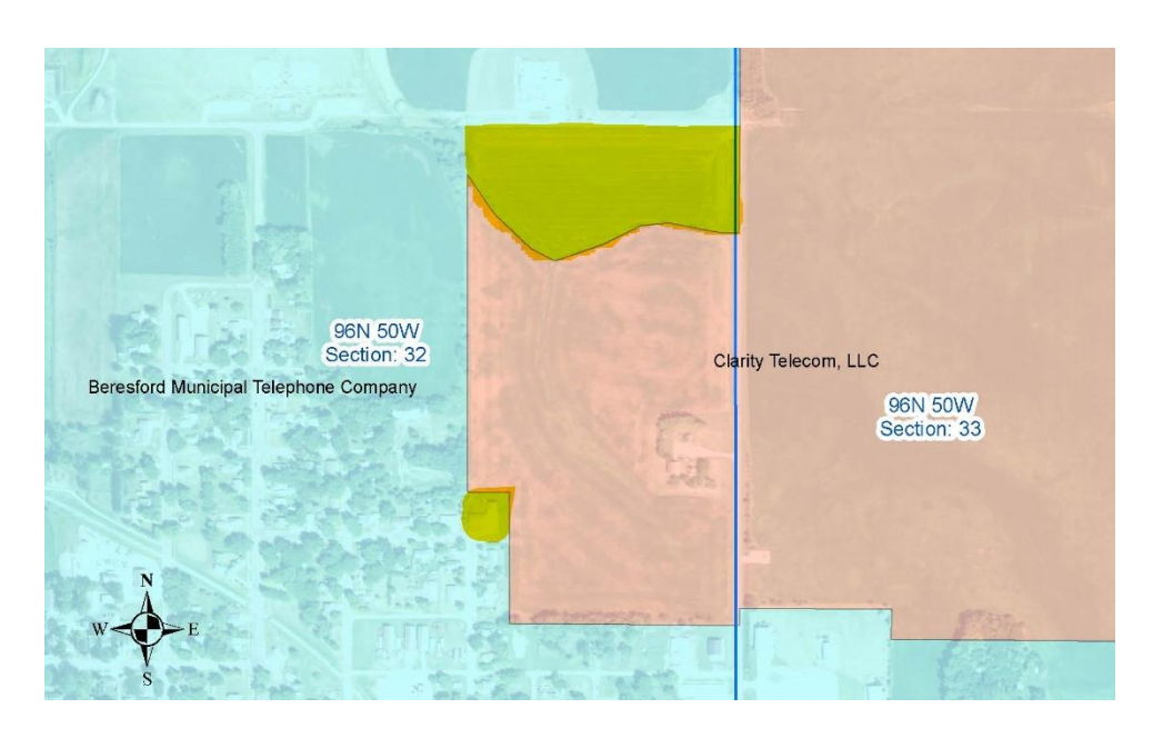
Map 3 – Additional Changes made in Docket TC22-057